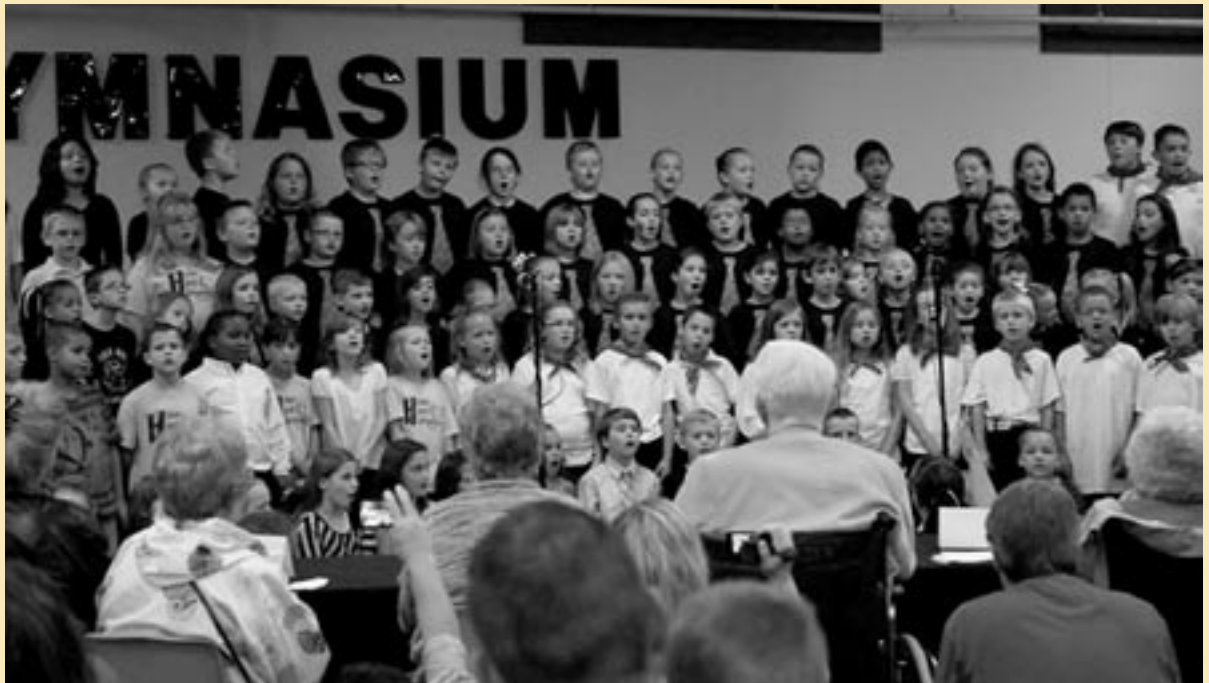
A combined choir from all the elementary schools sang Saturday morning at the pancake breakfast.