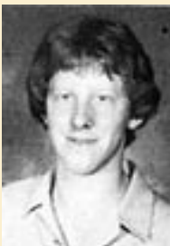
1981 Bentley Wright