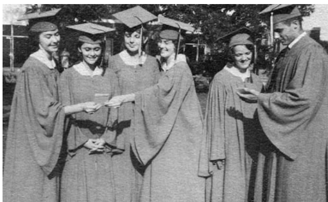
From the 1966 Archives, “Six Seniors=Two Diplomas?”